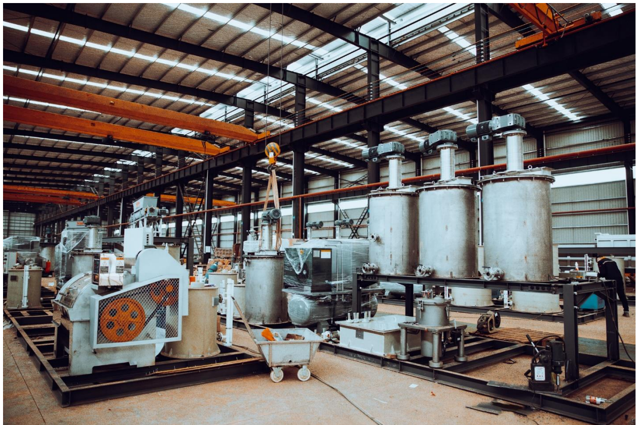
Assembly of the Chvaletice Manganese Project Demonstration Plant

TSXV: EMN | ASX: EMN | OTCQX: EUMNF WWW.MN25.CA